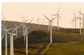
Leading Energy Companies