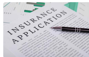
Major Insurance Providers