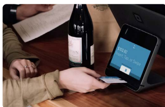
Top International Retailers