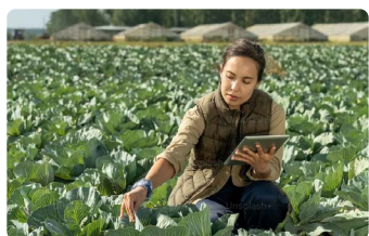
Major Agricultural Companies